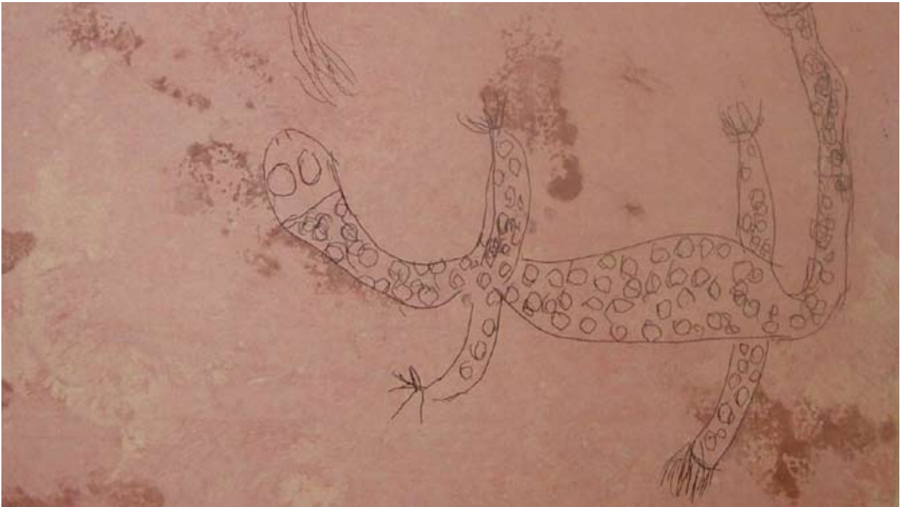
Nura Rupert, Milpatjunanyi - Wati Ngintaka , detail