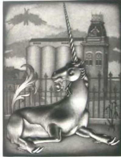
Greg Harrison, Das Einhorn and La Licorne , 2007 Mezzotint engraving, 39 x 53 cm Courtesy and © the artist