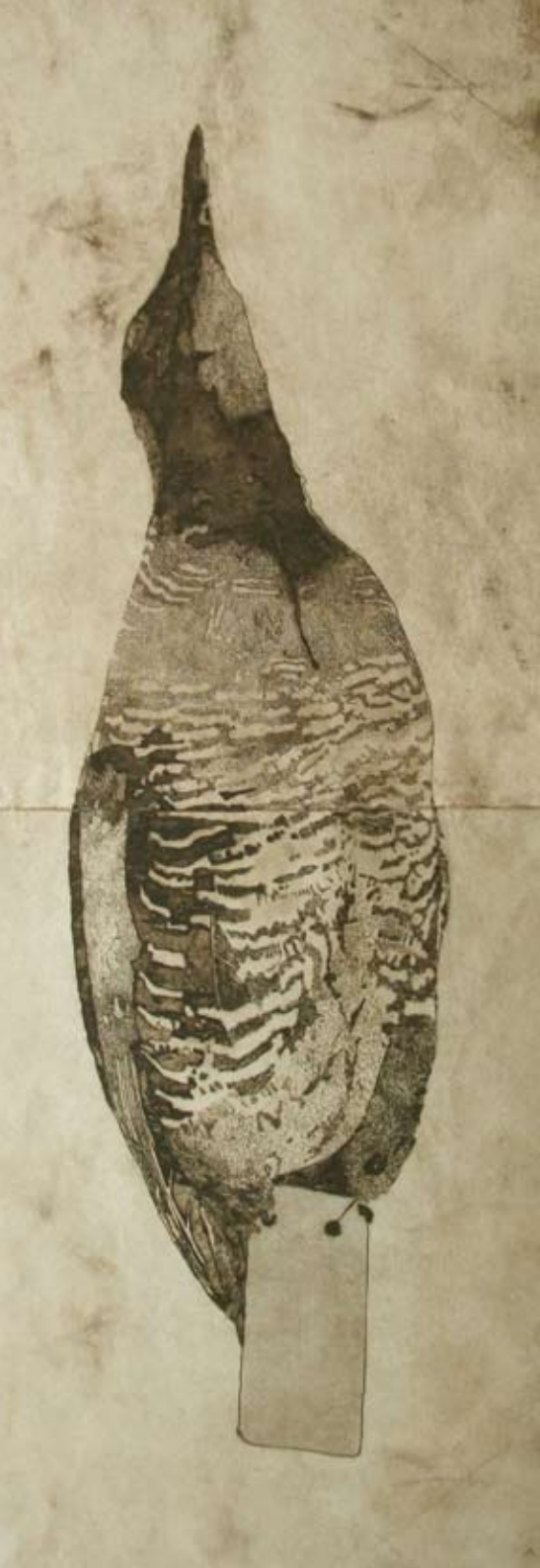
Christine Willcocks, Bird Skin , 2007 Cardboard etching on Vietnamese rice paper, 132 x 60 cm