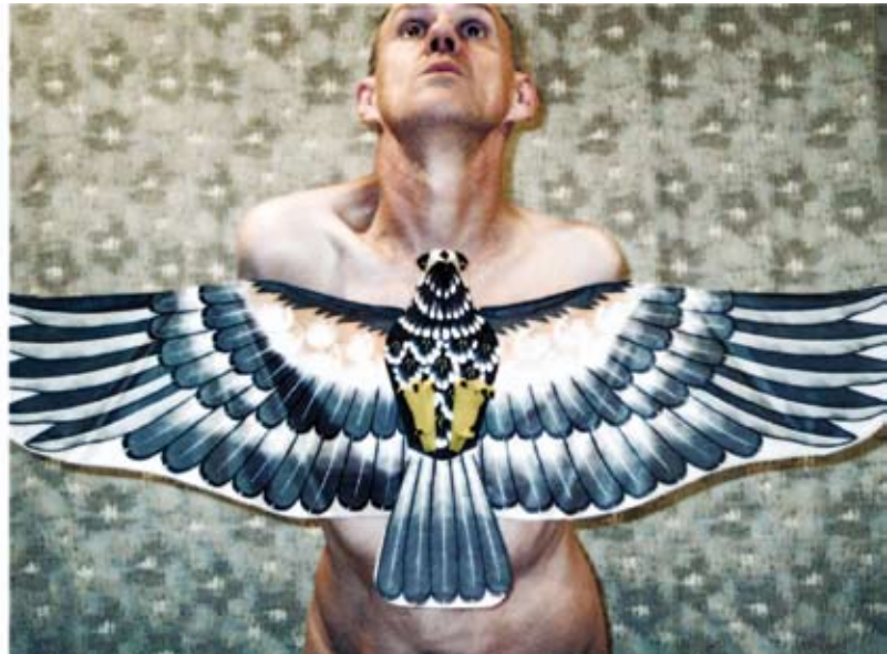
$3,000 Non-Acquisitive Prize Farrell & Parkin, Chinese Birds of Prey , 2006 Digital colour print, 56.7 x 136 cm Courtesy and © the artists