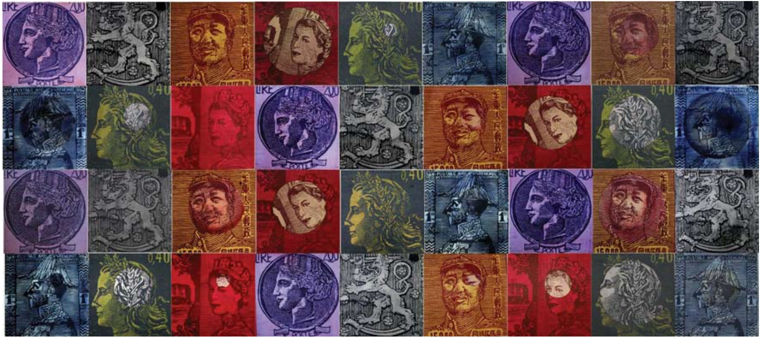
Antonietta Covino-Beehre, "Poste" Heads of State, 2006 Relief on wooden panels with assorted circular inlay cuts, 180 x 40.5 x 0.5 cm