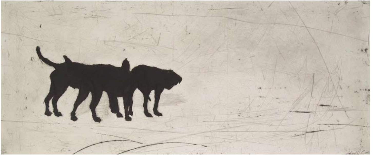
Deborah Williams, You Investigate Good Butts Only So You Can Slobber A Little , 2006 Engraving, roulette and drypoint intaglio print, 34.5 x 81.5