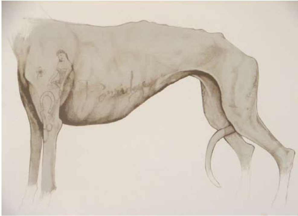
Aaron Hill, Porridge , 2007 Two colour lithograph, 35 x 50 Courtesy and © the artist