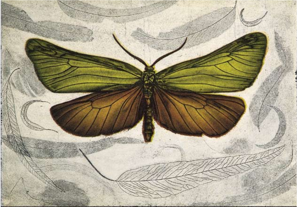
Tiffany McNab, The Forester , 2006 Etching, 42 x 43 cm Courtesy and © the artist