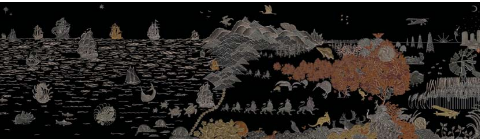
Erin Coates, Currency of the Commonwealth , 2006 Digital collage printed on archival metallic paper, 24.5 x 76 cm