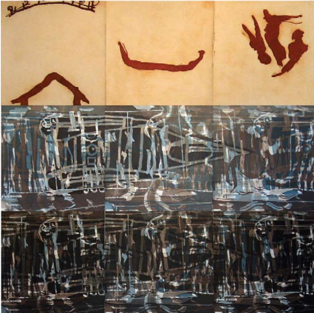
Above: Gary Shinfield, Raft , 2007 Etching in nine panels, 147 x 147 Courtesy and © the artist