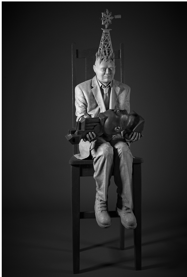
ABNEGATE , 2013, WOOD, FOAM, FIBREGLASS, FABRIC, PLASTIC AND ACRYLIC PAINT, 215 X 68 X 88 CM, COLLECTION OF JAN SPRIGGS AND PERRY SANDOW.