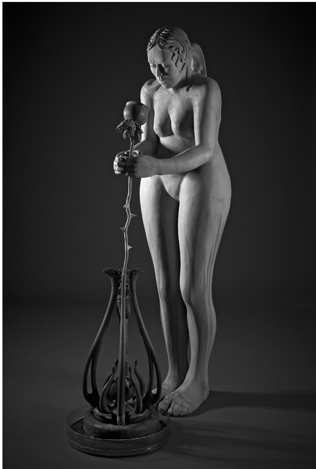
EPOCH , 2013, FIBREGLASS, RESIN, WOOD, PLASTIC, PERSPEX, ACRYLIC AND OIL PAINT, PETG, 185 X 106 X 48 CM, COLLECTION OF GRAEME ROWLEY AND LORRAINE WARNER.