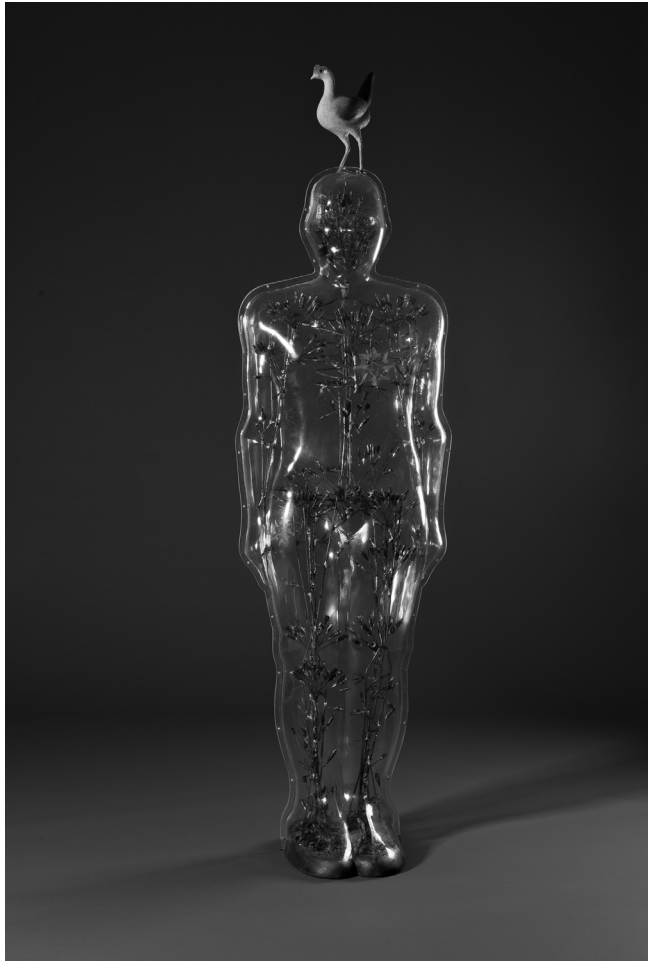
MEEK , 2013, METAL, WOOD, FIBREGLASS, ACRYLIC AND OIL PAINT, PETG, 203 X 59 X 40 CM, COLLECTION OF GRAHAM AND VICKI TEEDE.