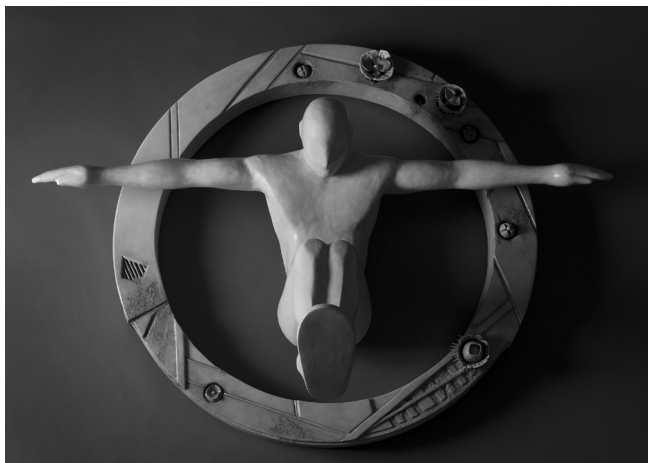
APERTURE , 2013, FIBREGLASS, RESIN, WOOD, ACRYLIC AND OIL PAINT, 135 X 107 X 98 CM, COLLECTION OF DR HENNER HEMPRICH.