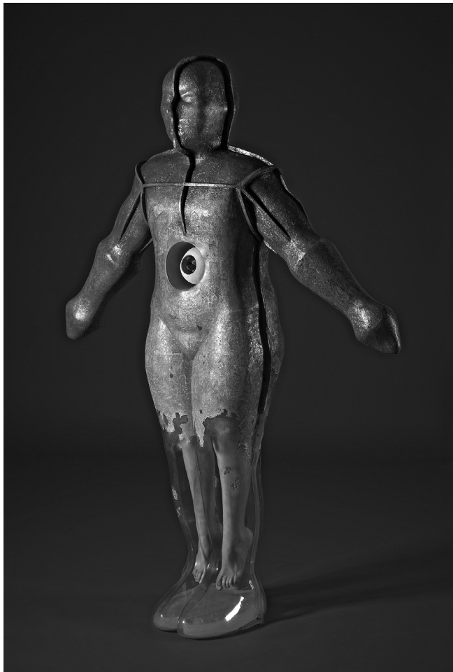
SPROUT , 2013, FIBREGLASS, RESIN, WOOD, ALUMINIUM FOIL, PLASTIC, PERSPEX, ACRYLIC AND OIL PAINT, PETG, 180 X 124 X 41 CM, COLLECTION OF LLOYD AND ELIZABETH HORN.