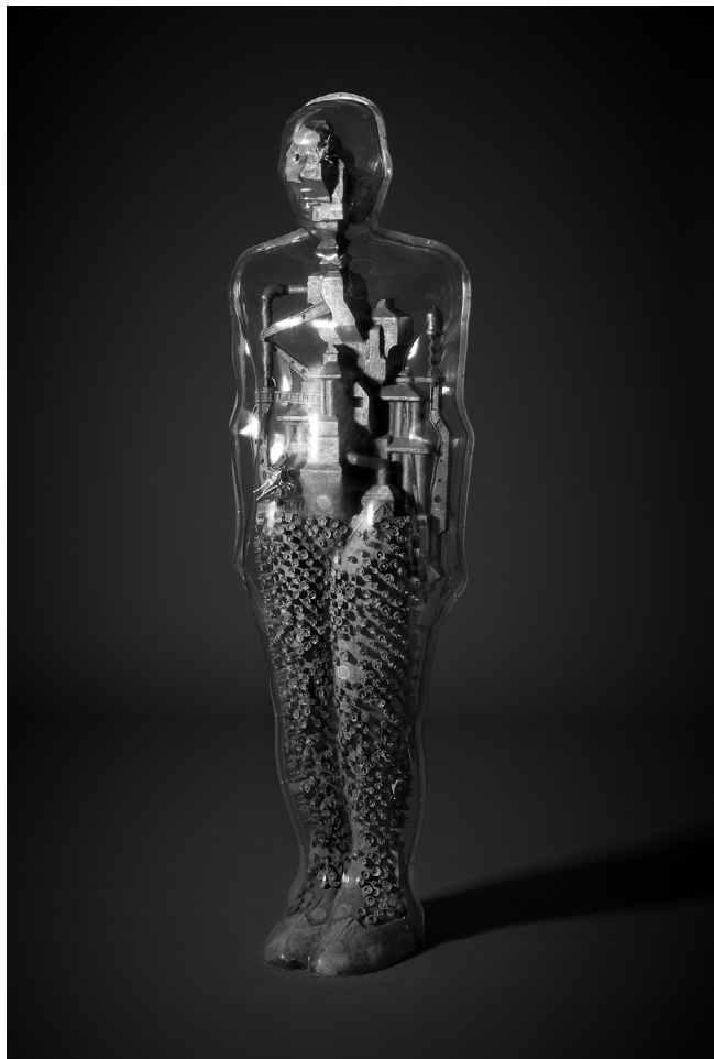
MICROCOSM , 2013, PLASTIC, WOOD, CAST PEWTER, RESIN, ACRYLIC AND OIL PAINT, PETG, 176 X 59 X 41 CM, COLLECTION OF DALE AND JAN ALCOCK.