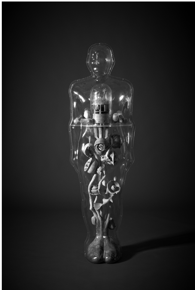
ALCHEMIST , 2013, WOOD, PERSPEX, STONES, ACRYLIC AND OIL PAINT, PETG, 180 X 59 X 41 CM, COLLECTION OF RON AND SANDRA WISE.