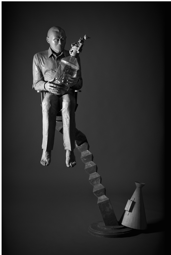
RUMINATE , 2013, FIBREGLASS, RESIN, FABRIC, WOOD, STEEL, PERSPEX, PLASTIC, ACRYLIC AND OIL PAINT, 207 X 120 X 86 CM, COLLECTION OF DANIEL AND BIANCA WISE.